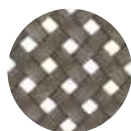
092 taupe light