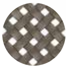
092 taupe light